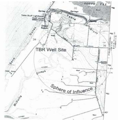
Well Site Sphere of Influence for Table Bluff Reservation

COPY FROM CANNIBAL ISLAND 7.5 MINUTE QUAD